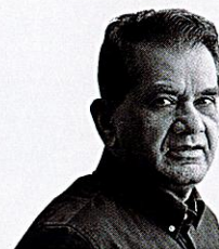
Amitabh Kant G20 Sherpa, India